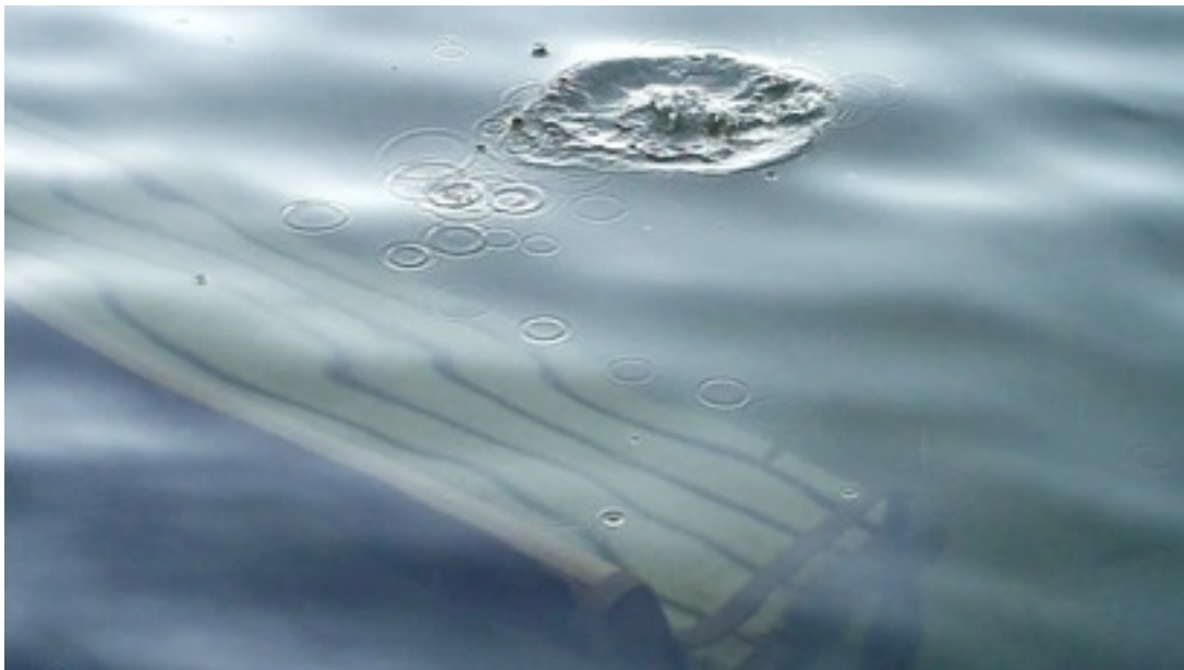
Walden Pond - Fall 2010

Once you have finished your final essays, please write a brief evaluation of this experience. In this account, please describe the ways in which "play" assisted you in the generation of ideas, as well as anything surprising that you encountered along the way. In addition, let me know how the desire to represent solitude, friendship, and society was assisted by the use of narrative, and how your use of narrative was assisted by images and words. Finally, Let me know how walking around the quad in this manner affected the way that you perceived these benches and their interrelationship, and how you now map this space as a student; does your new map feel artistic, personal, or both? Feel free to go beyond these two choices if your feelings are best described differently, or if (God forbid) you feel no different after this crazy experiment! This evaluation can be as long as you desire.